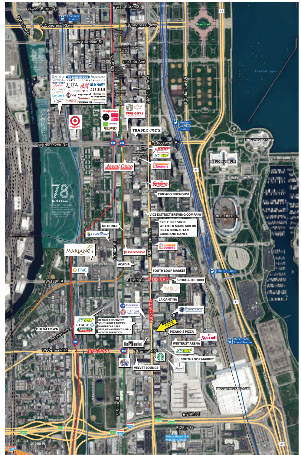
2111 S MICHIGAN AVE, CHICAGO, ILLINOIS